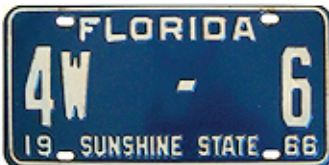
1966, white on blue