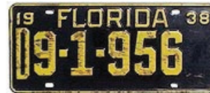
1938, yellow on black