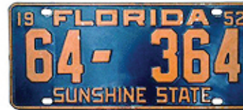
1952, orange on blue