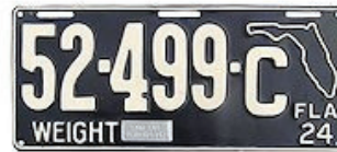
1924, white on black (2)