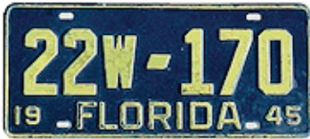
1945, yellow on black