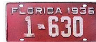
1936, white on red