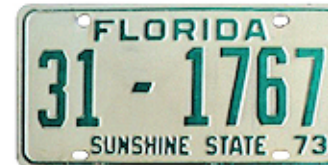
1973, green on white