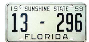
1959, dark green on white