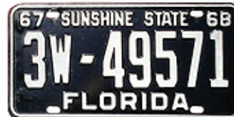
1967-1968, white on black