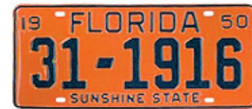
1950, blue on orange