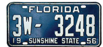
1956, white on blue