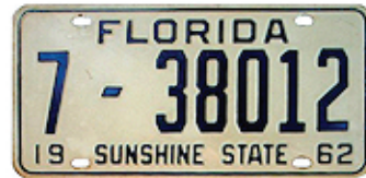
1962, blue on white