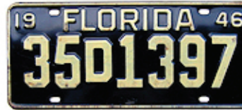
1946, white on dark blue