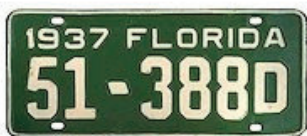
1937, white on green