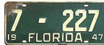
1947, white on green