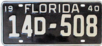
1940, white on black