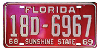
1968-1969, white on red