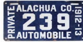
1912 - 1913, Alachua Co.