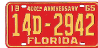
1965, yellow on red