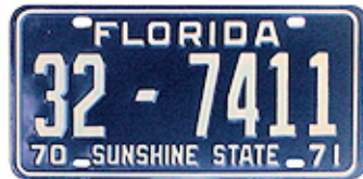
1970-1971, white on blue