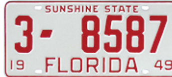
1949, red on white