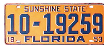
1953, blue on orange