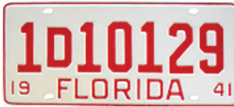
1941, red on white