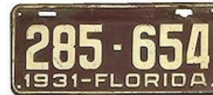
1931, white on maroon