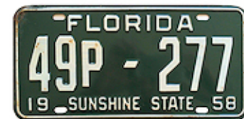
1958, white on dark green