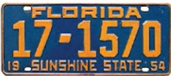
1954, orange on blue