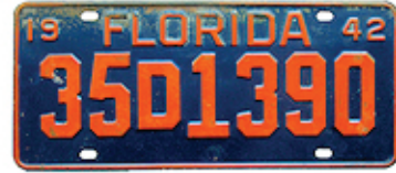
1942, orange on blue