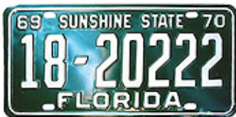
1969-1970, white on green