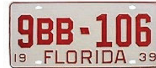
1939, red on white

County code/prefixes were introduced in 1938.