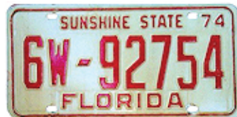
1974, red on white