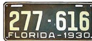
1930, white on green