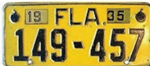
1935, black on yellow with black on yellow lock strip