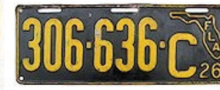
1926, yellow on black