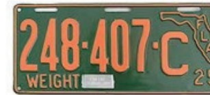
1925, orange on green (2)