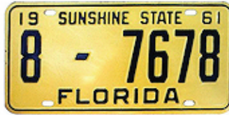
1961, dark blue on yellow