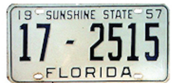
1957, blue on white