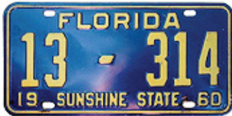
1960, yellow on blue