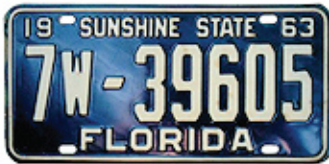
1963, white on blue