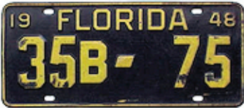
1948, yellow on black