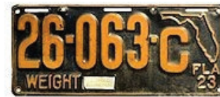
1923, orange on dark blue