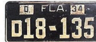
1934 white on black with ...