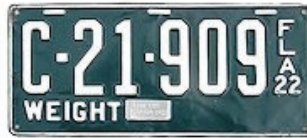
1922, white on green (2)