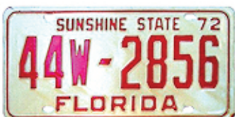
1972, red on white