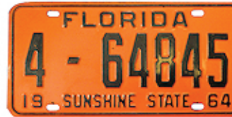
1964, blue on orange