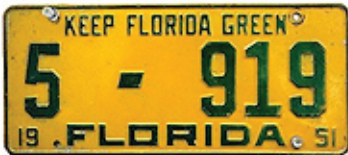
1951, green on yellow