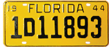
1944, black on yellow