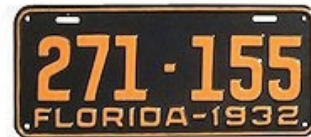
1932, orange on black