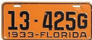
1933, black on orange