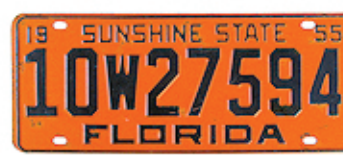
1955, blue on orange