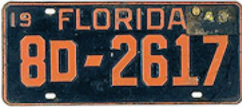
1942, orange on blue and 1943 yellow on blue tab